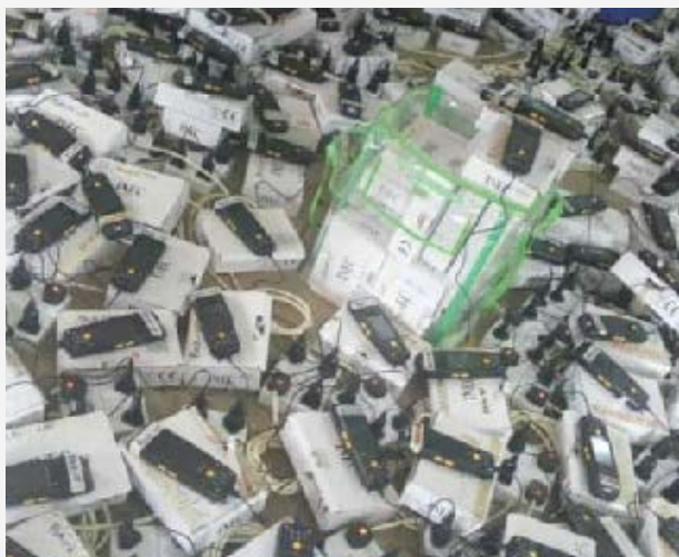
Charged Card Readers at INEC Bayelsa State Office.

Observers reported cases where presiding officers refused to use the card readers during the collation process, such as in Ekeremor Ward 8, Southern Ijaw Ward. This makes ward-level results vulnerable to voter impersonation and inflation. In instances where the majority of polling units reported 100% use of the card readers, the voter turnout reported was normally well below the turnout reported in places where card readers were not used or were set aside at a point (with results often 80% or more). This was demonstrated in Ogbia Ward 12, where more than 60% (10 of 14 units) of the polling units reported average turnout of 43%. These lower turnouts were much closer to the level of participation noted by observers (sometimes less than 20%), and attributed to voter apathy and scepticism over the credibility of the election process.