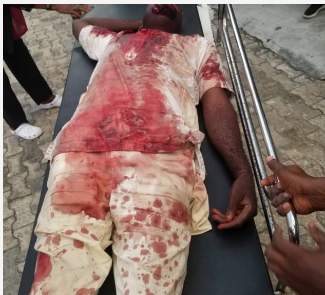
Injured person at the PDP Rally in Nembe, Bayelsa State