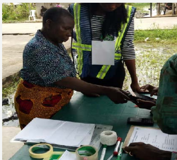
Accreditation and voting ongoing, Ward 1, Unit 1

Our observers, and indeed others from various observation groups (such as CDD, Yiaga), reported easy access to the polling units and ward collation centres. However, ward collation did not take place in a number of places where unit level election materials, meant for ward collation, were diverted to unauthorised destinations such as private residences, and hotels. In Sagbama LGA, election materials were diverted to a hotel in Toru-Orua community. Members of the APC and PDP were accused of sponsoring these acts to influence the outcome of the election in their favour.