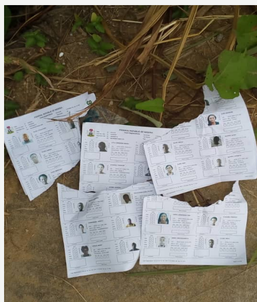
Snatched ballot papers dumped in a nearby creek

Violence also continued to target collation in some areas—an attack in Brass Local government, Twon, led to the relocation of all collation centres to Yenagoa. Other cases of attempts to disrupt collation were reported in Ekeremor.