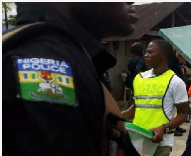
Nigerian Police Command escort the delivery of a ballot box and materials.

There was minimal violence on election day compared to previous election cycles where people were killed, election materials destroyed, and collation processes disrupted on election day. Although there were a few incidents of ballot box snatching and other types of electoral abuse, observers reported instances where security agencies prevented attempts to disrupt the electoral process. However, there were also instances where security personnel stood by as political thugs snatched ballot boxes and attempted to disrupt the electoral process—specifically in Kolokuma/Opokuma LGAs, Ward 1, PU 003 and Nembe LGA, Igbeta-Ewoama Ward, PU 002.